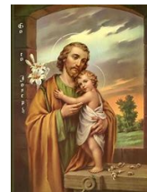
St. Joseph, spouse of Our Lady, pray for us.